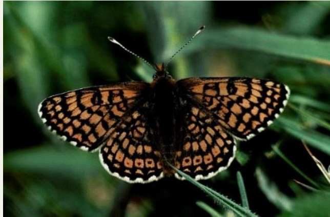
Glanville Fritillary, IOW 1974