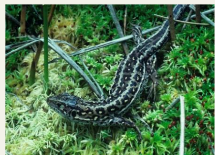
Broad-bodied Chaser Libellula depressa - Damselfly trapped in Sundew - Sand lizard Arne 1978